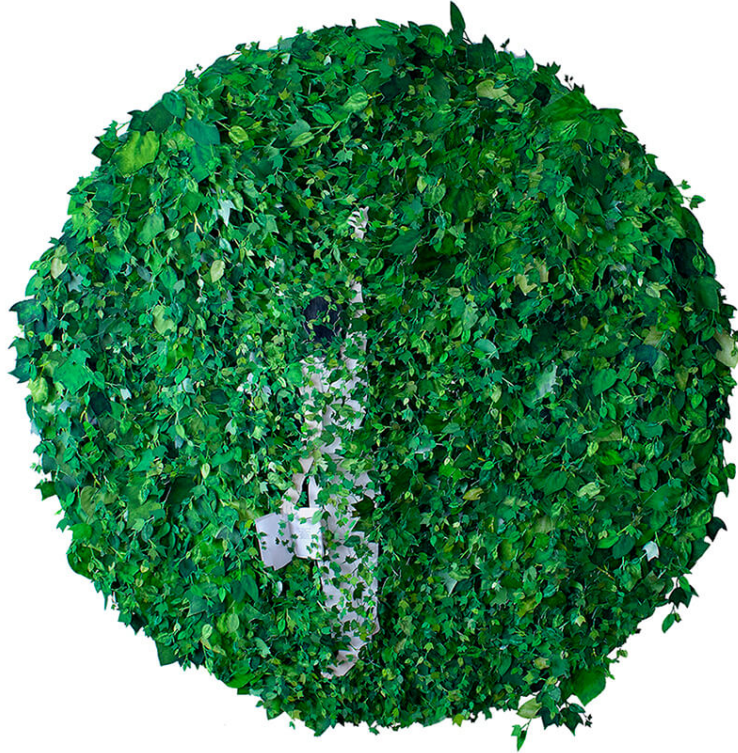
Artwork by Angelica Bergamini.