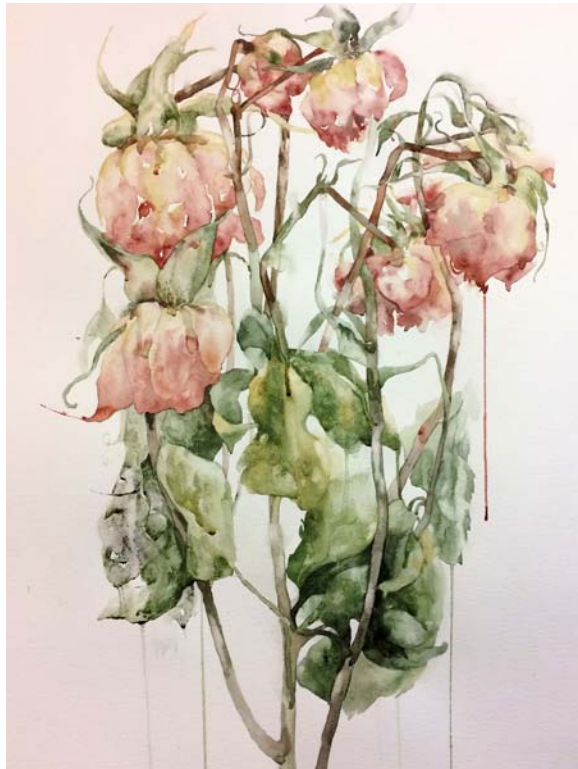
Artwork by Kay Sirikul Pattachote.